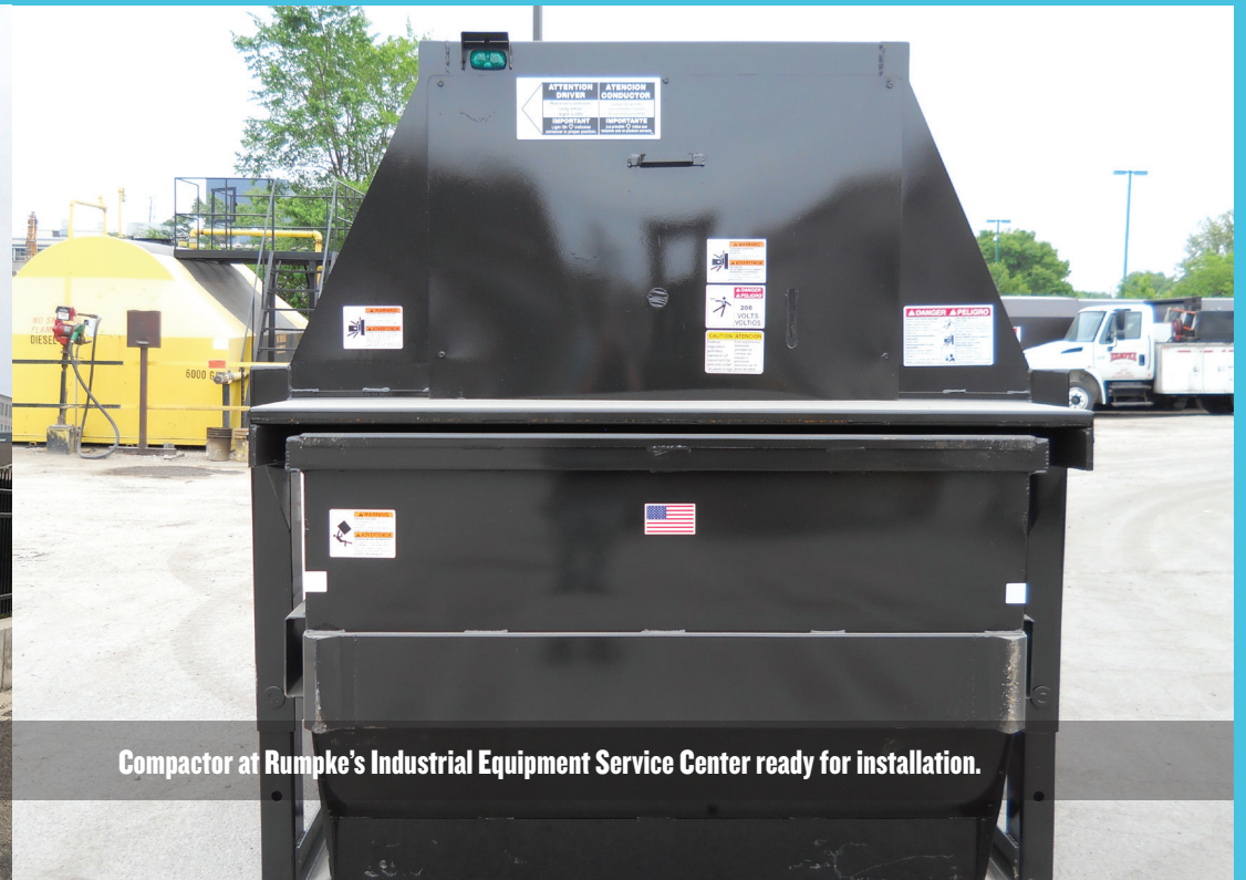
Compactor at Rumpke's Industrial Equipment Service Center ready for installation.