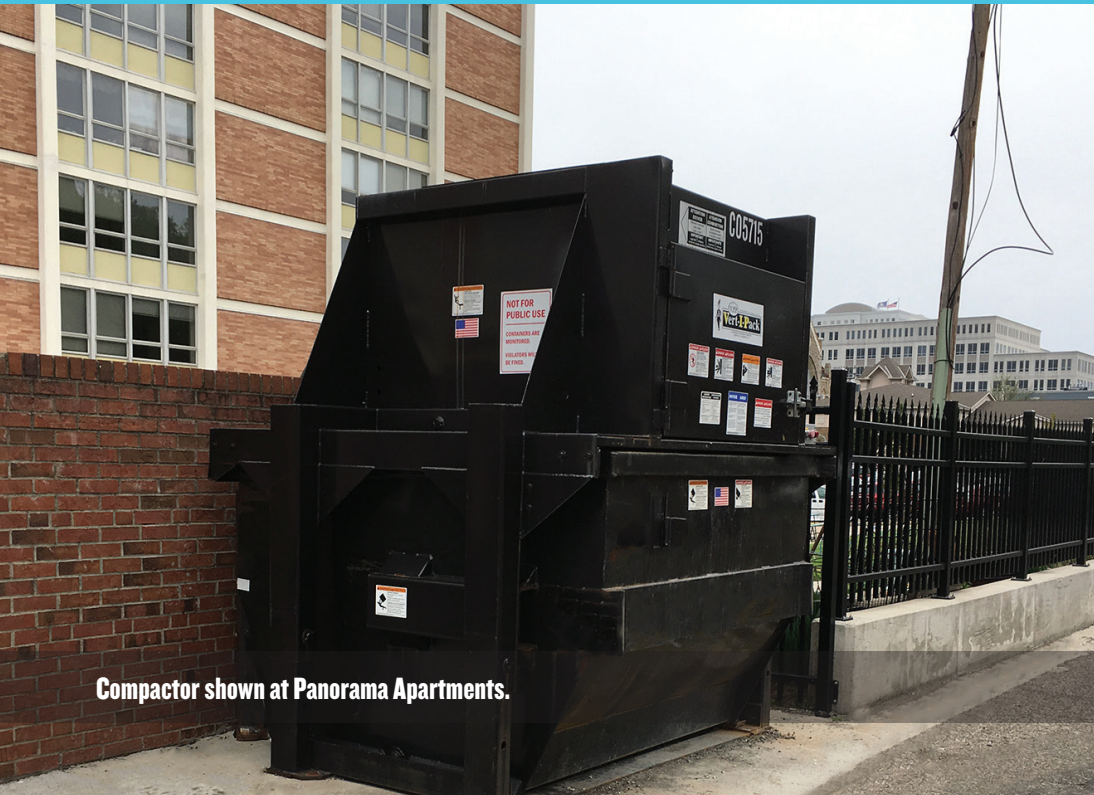
Compactor shown at Panorama Apartments.